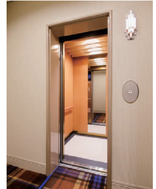
9-person passenger elevator (for bridal use only) After renovation