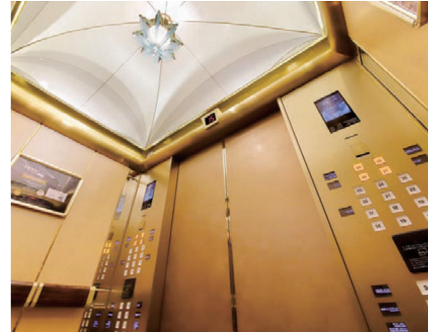
20-person passenger elevator, elevator car ceiling After renovation