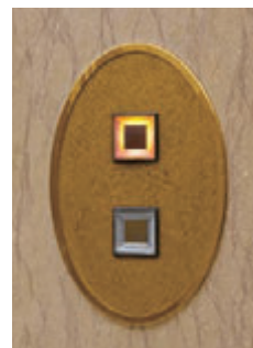
20-person passenger elevator hall buttons Before renovation