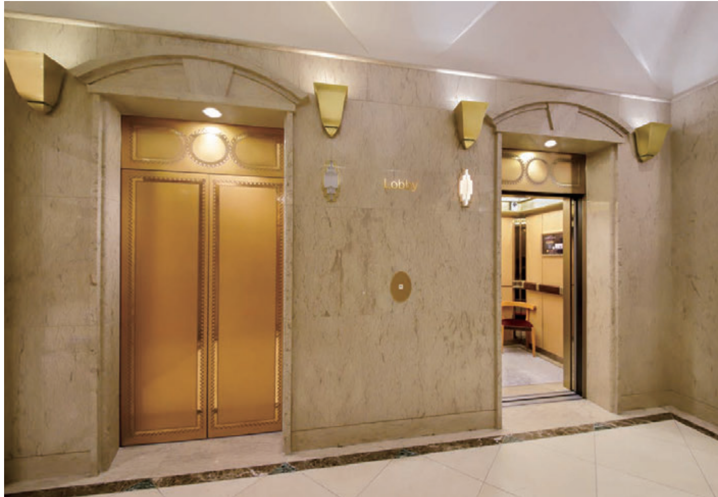
20-person passenger elevator, 1st floor (the existing hall doors were installed within the new door system in the Toshiba Elevator plant) After renovation