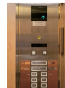
20-person passenger elevator, control panel Before renovation