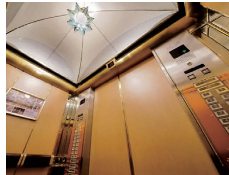
20-person passenger elevator, elevator car ceiling Before renovation