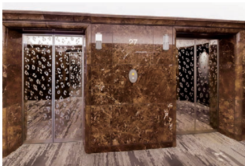
20-person passenger elevator, 27th floor (the existing hall doors were installed within the new door system in the Toshiba Elevator plant) After renovation