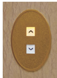
20-person passenger elevator hall buttons After renovation