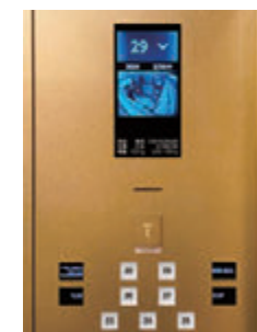
20-person passenger elevator, control panel After renovation