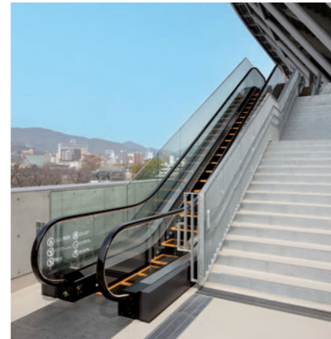
Escalator, 3rd floor