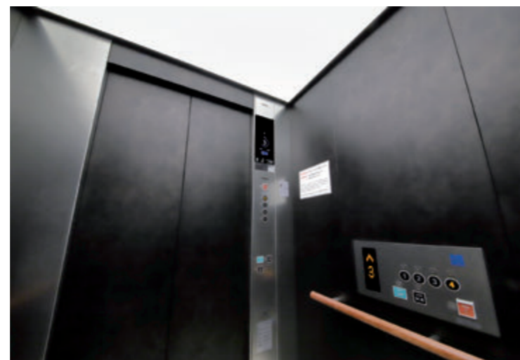
15-person passenger elevator, elevator car ceiling