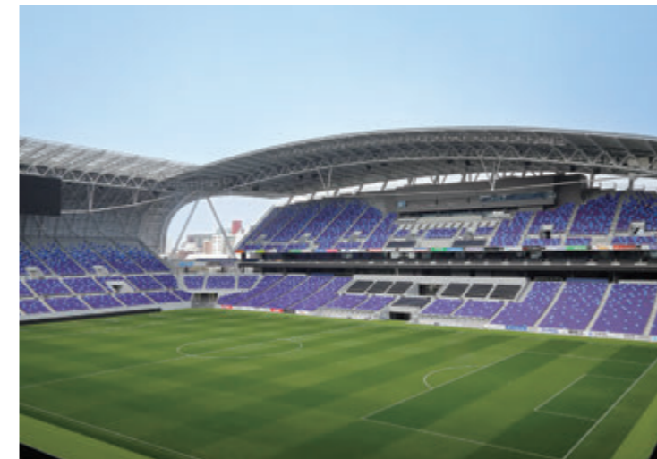
Building exterior (stadium)