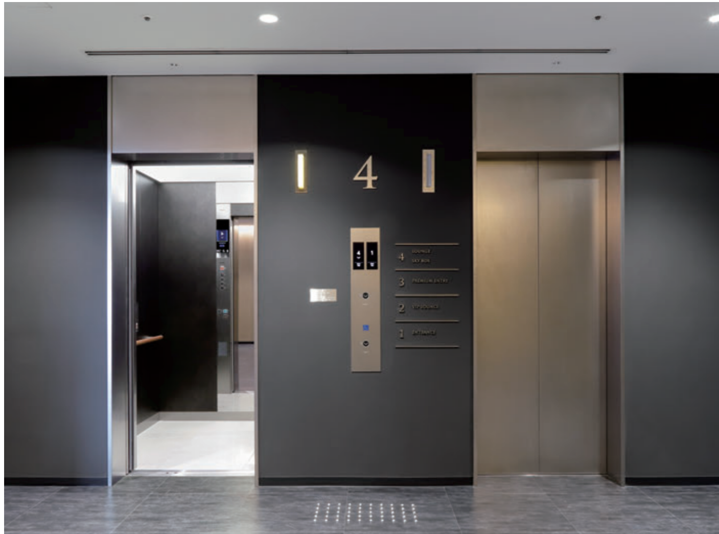
15-person passenger elevator, 4th floor