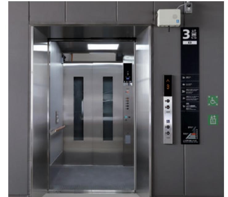
24-person passenger elevator (also used for emergencies: this elevator is envisaged for use in the evacuation of people who have trouble walking in the event of a disaster)