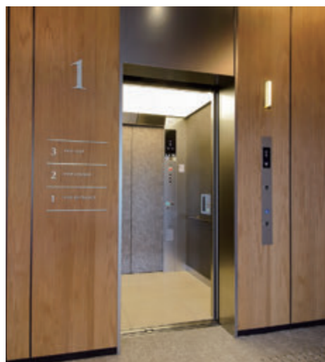
15-person passenger elevator, 1st floor (VIP elevator)