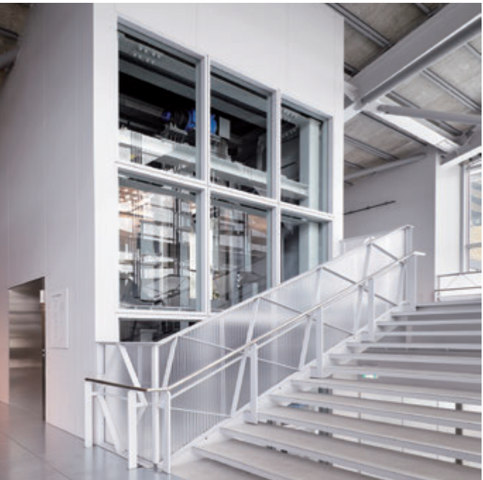
18-person passenger and freight (observation) elevator, elevator shaft (NOVARE Academy)