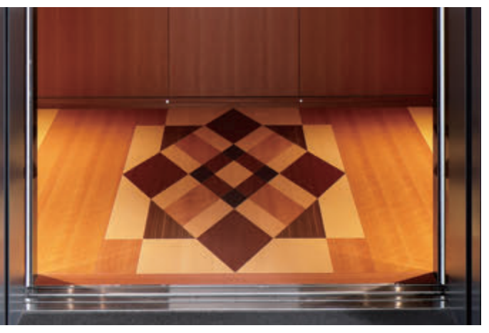
26-person passenger and freight (and emergency) elevator, elevator car floor (NOVARE Archives)