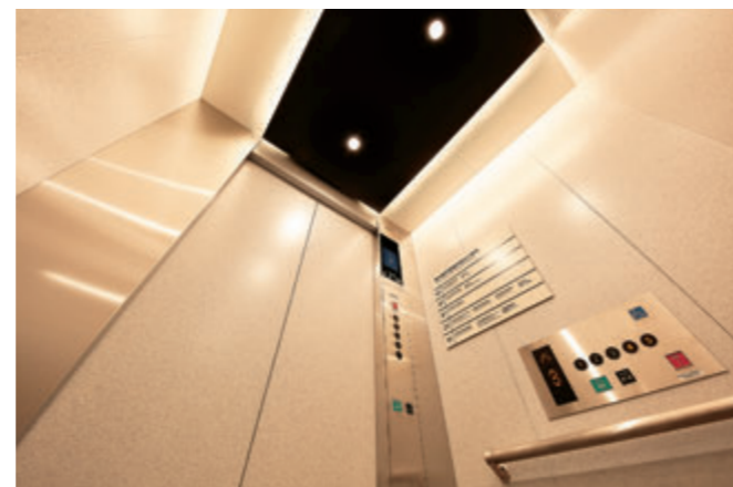
13-person passenger elevator, elevator car ceiling