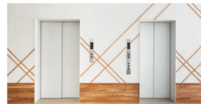
20-person and 13-person passenger elevator, 3rd floor hall (walls: Takahara cypress (from the north of the prefecture))