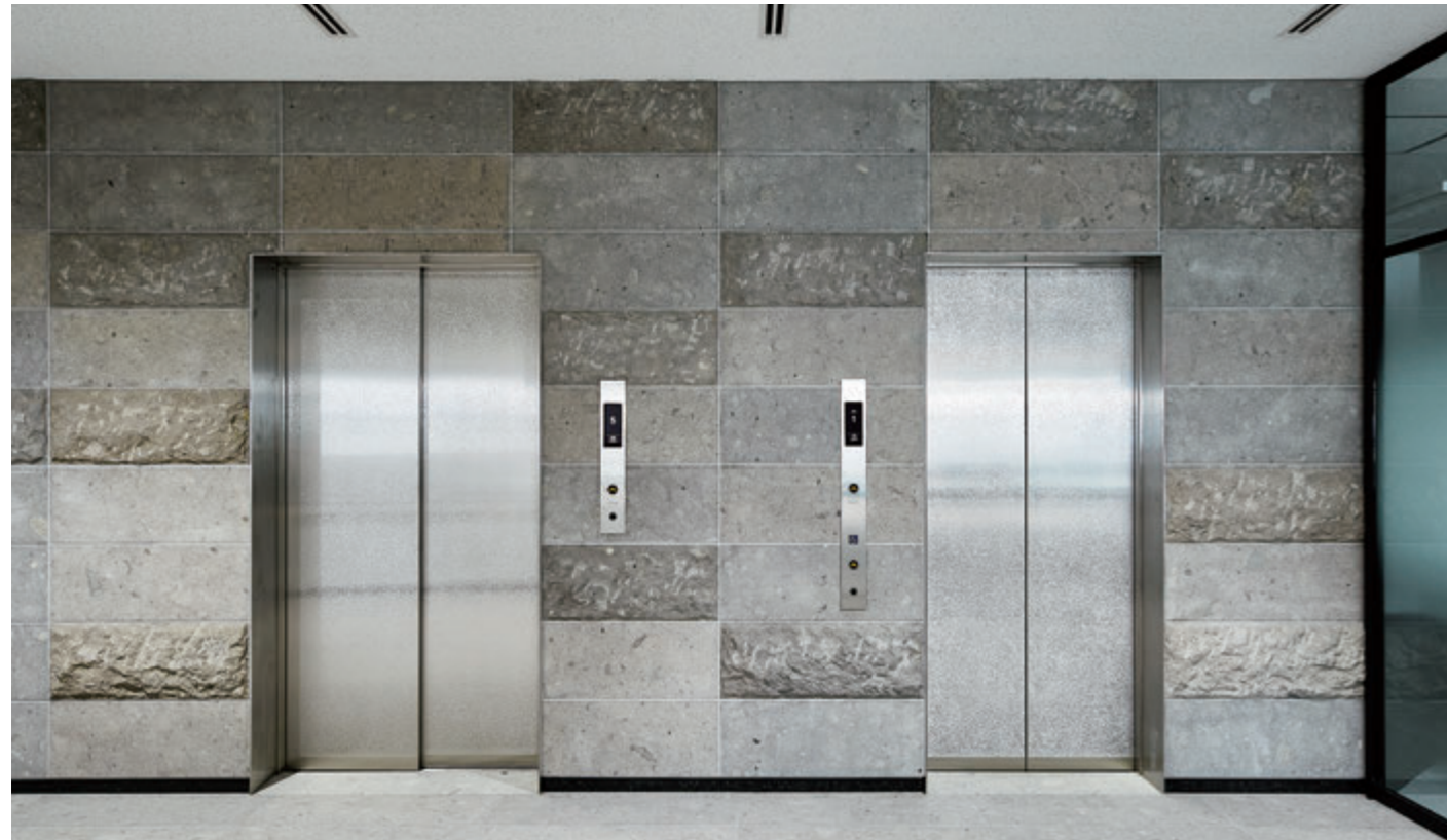
20-person and 13-person passenger elevators, 1st floor hall (walls: Ashino Stone (from the north of the prefecture))