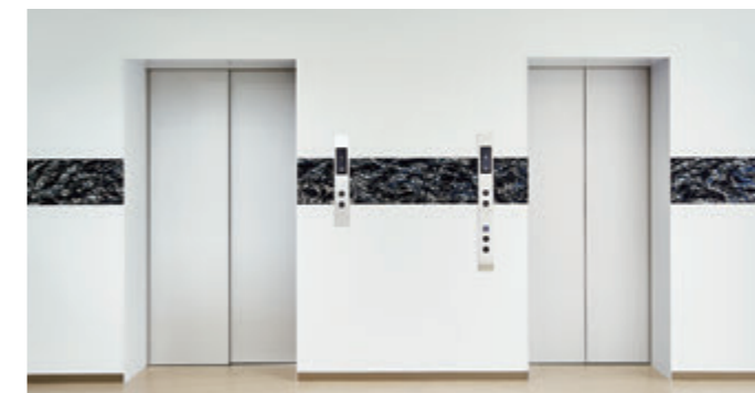
20-person and 13-person passenger elevators, 4th floor hall (walls: Kurobane-aizome dyeing (designated Tochigi Prefecture traditional craft))