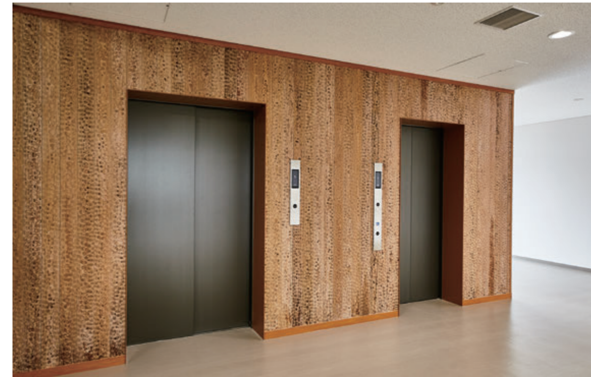
20-person and 13-person passenger elevators, 5th floor hall (walls: Yamizo cedar (from the north of the prefecture))