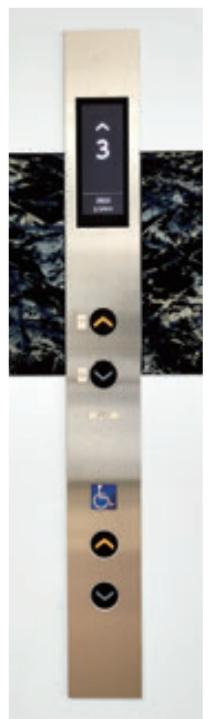
Elevator hall LCD indicator buttons (embedded elevator hall buttons for wheelchair users)