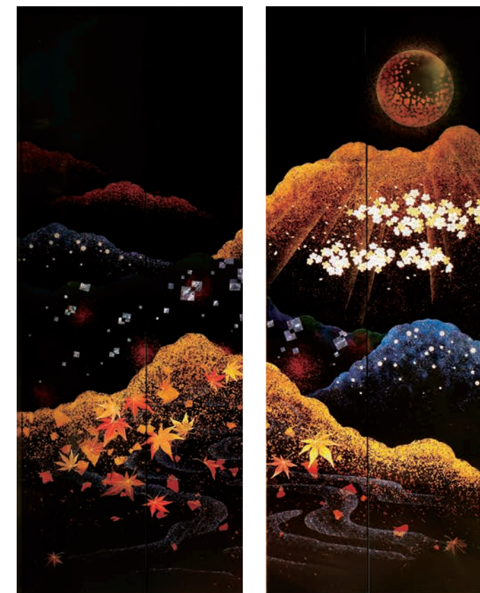
15-person passenger elevator, hall door (painted and lacquered by Kyoto City Hall)