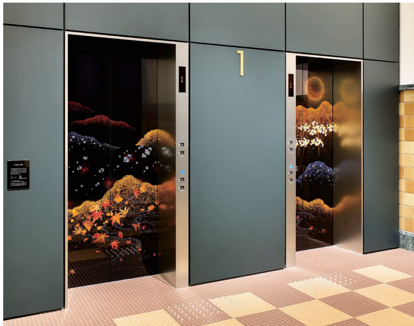
15-person passenger elevator, 1st floor hall