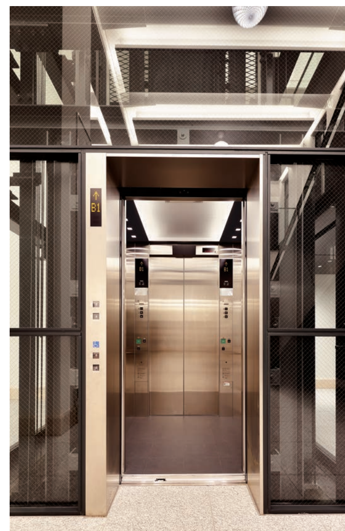
13-person passenger (observation) elevator, elevator car