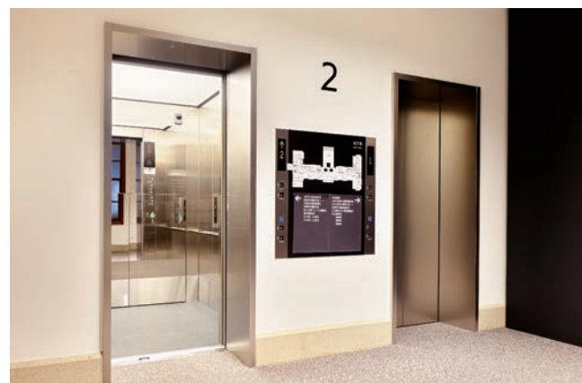
15-person passenger elevator, 2nd floor hall