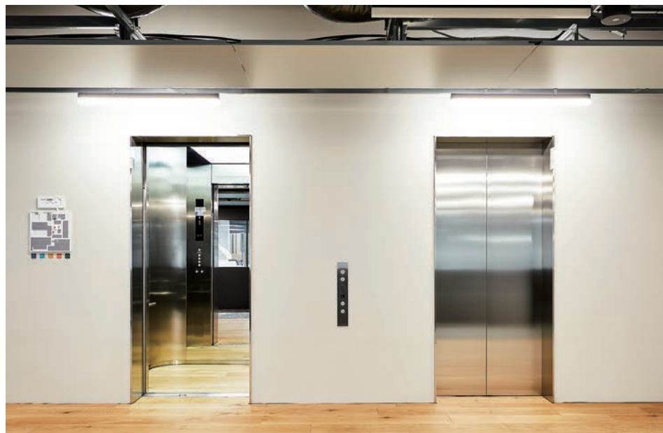
17-person passenger elevator, 2nd floor hall