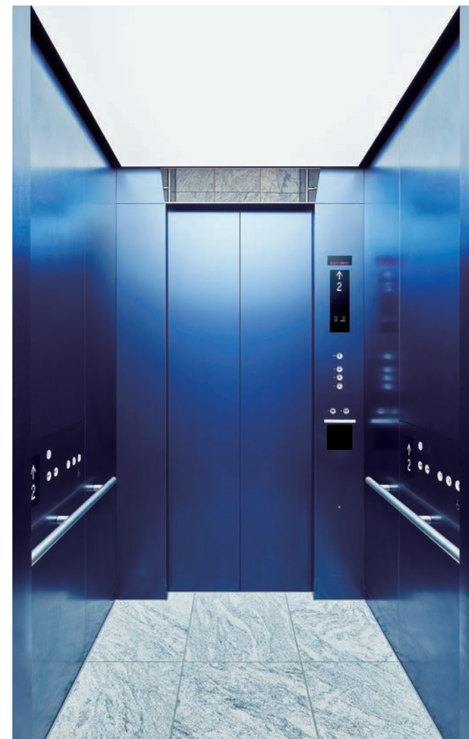
15-person passenger elevator, elevator car