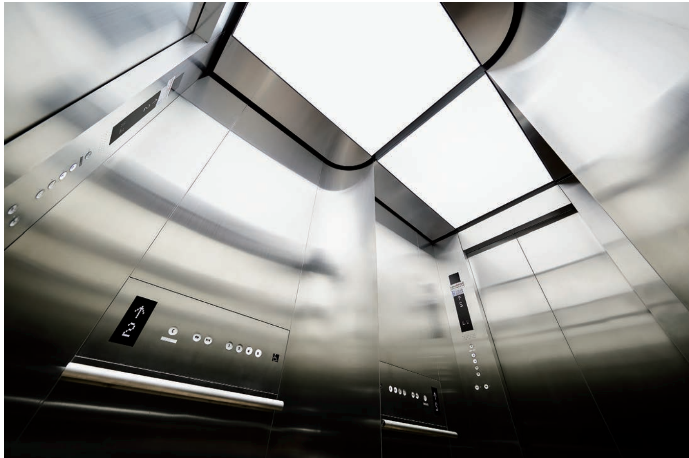
17-person passenger elevator, elevator car ceiling