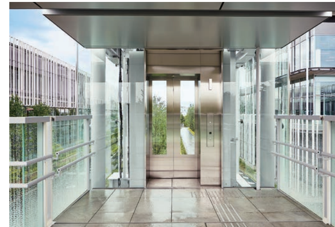
15-person passenger (observation) elevator, 2nd floor hall