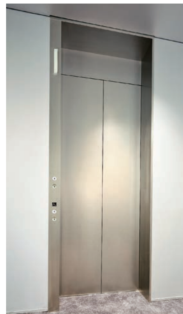
15-person passenger elevator, 2nd floor hall