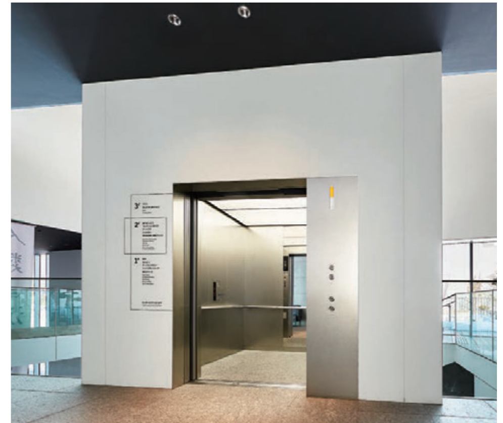
30-person passenger elevator, 2nd floor landing