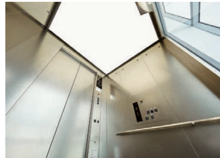
15-person passenger (observation) elevator, elevator car ceiling