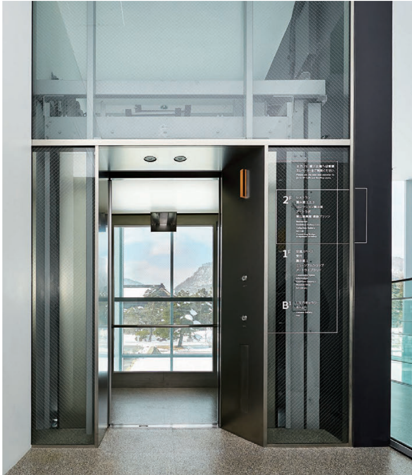
15-person passenger (observation) elevator, 2nd floor lobby (view of the snow-covered Zenkoji Temple from the elevator's observation windows)