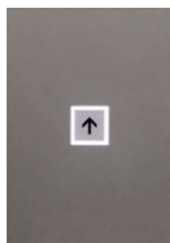
Elevator hall buttons, 1st floor (after renovation)