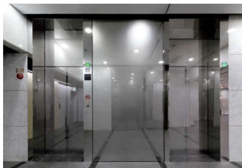
Elevator hall buttons, 1st floor (before renewal)