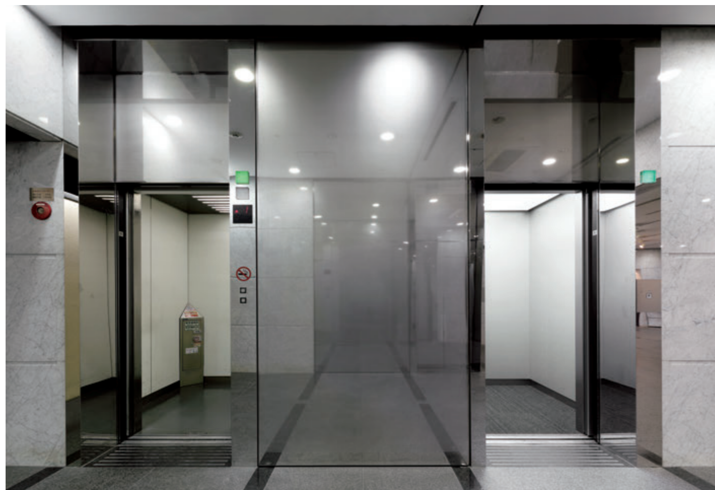
17-person (emergency) passenger elevator (left: before renovation) / 13-person passenger elevator (right: after renovation), 1st floor hall