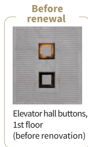
Before renewal Elevator hall buttons, 1st floor (before renovation)