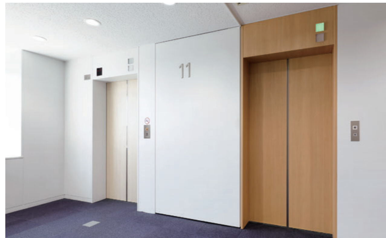
17-person (emergency) passenger elevator (left: before renewal) / 13-person passenger elevator (right: after renewal), 11th floor elevator hall