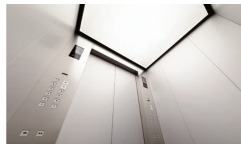
17-person (emergency) passenger elevator, elevator car ceiling (before renewal)