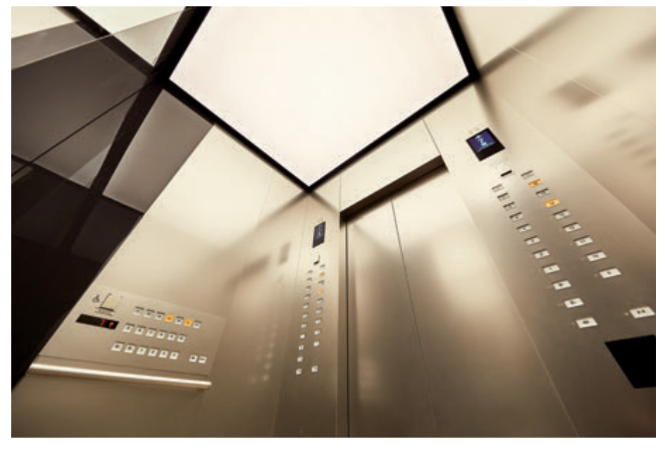
24-person passenger elevator car ceiling (after renewal)