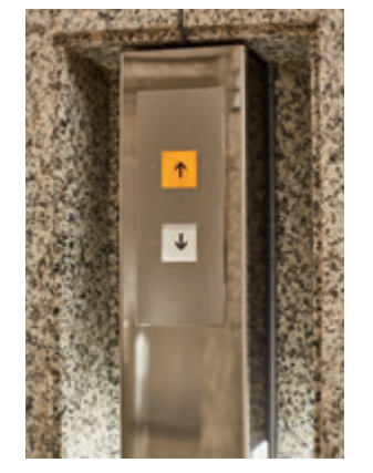
Elevator hall buttons, 1st floor (post-renovation)