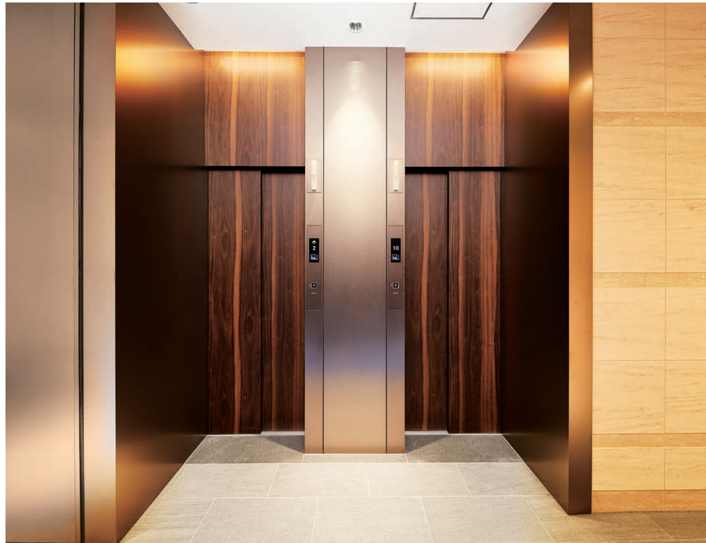
13-person and 9-person passenger elevators , 2nd floor elevator hall