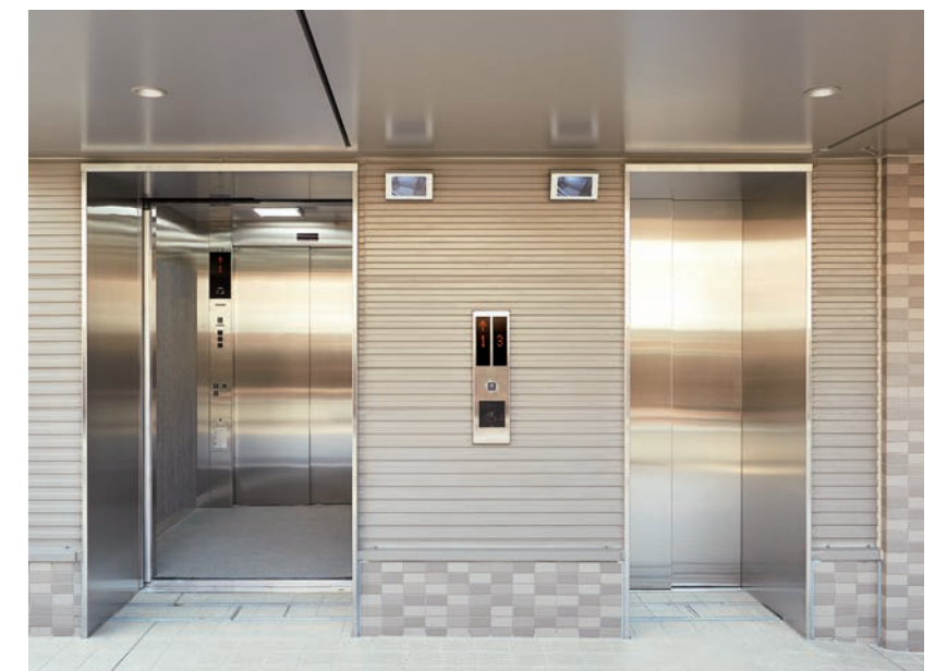
20-person passenger elevator and 13-person residential passenger elevators, 1st floor elevator hall