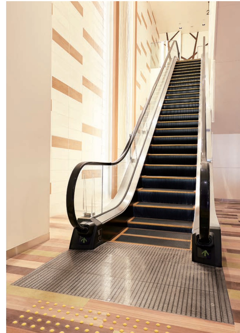
Escalator, 1st floor