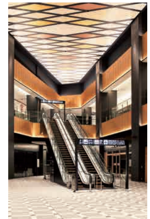
Escalator (Shopping City)