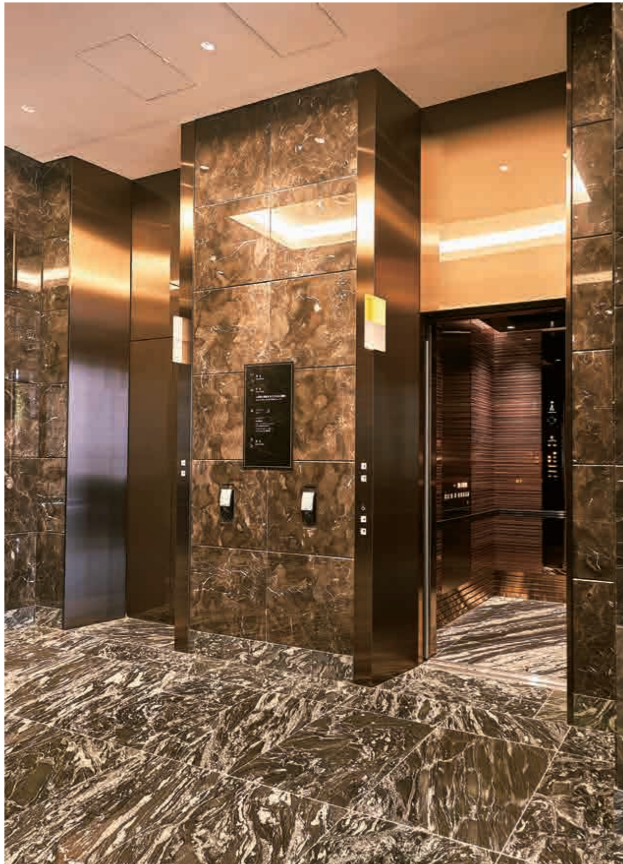
17-person passenger elevator, 4th floor elevator hall (Hotel Villa Fontaine Premier Haneda Airport)