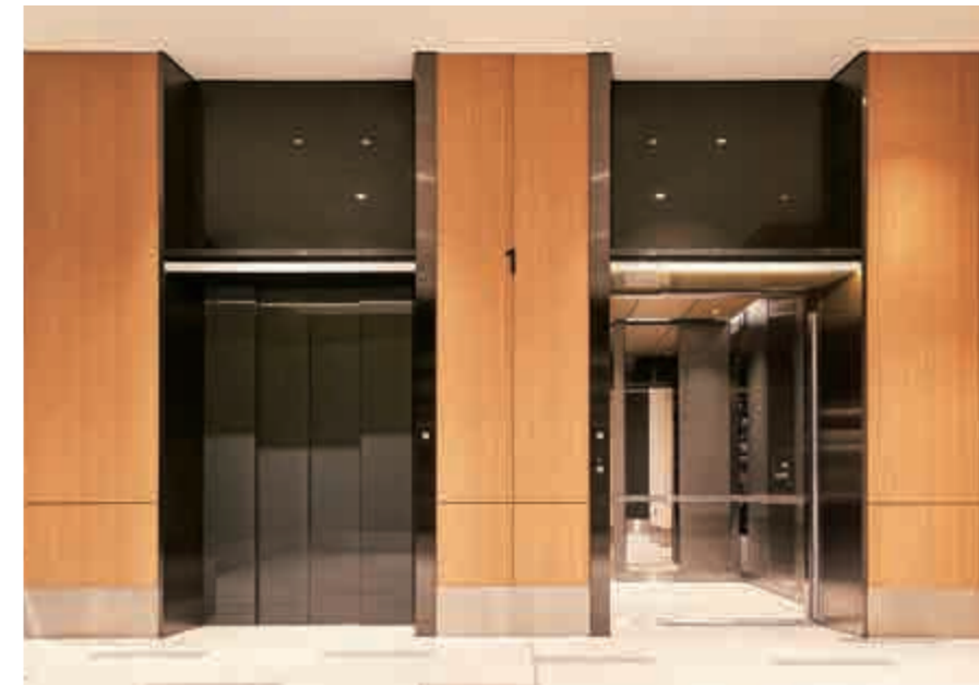
24-person passenger elevator, 1st floor landing (Shopping City)