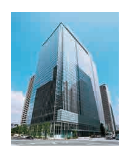
Building exterior g) (Otemachi One Tower)