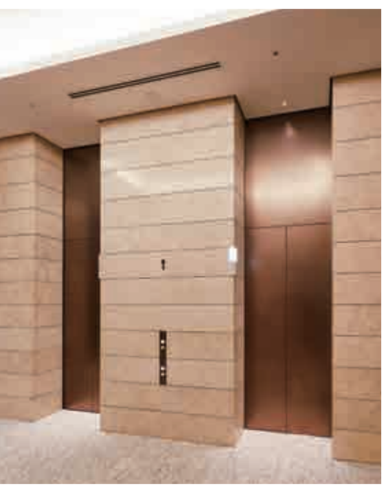
17-person passenger elevator, 1st floor elevator hall (Otemachi One Tower)