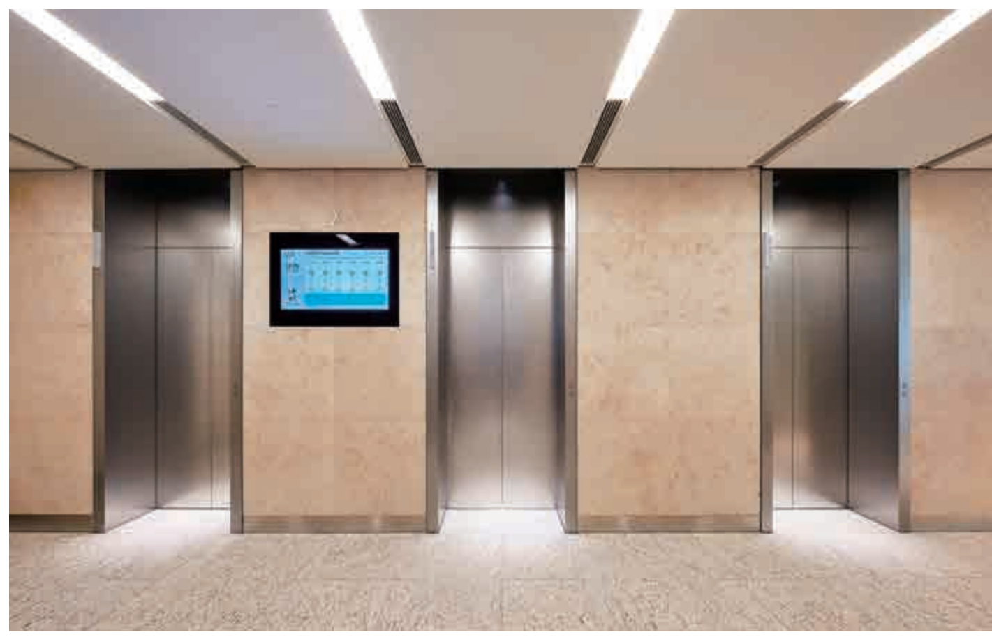
30-person passenger elevator, 2nd floor elevator hall (Mitsui Bussan Building)