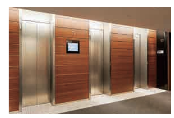
30-person passenger elevator, 11th floor elevator hall (Mitsui Bussan Building)