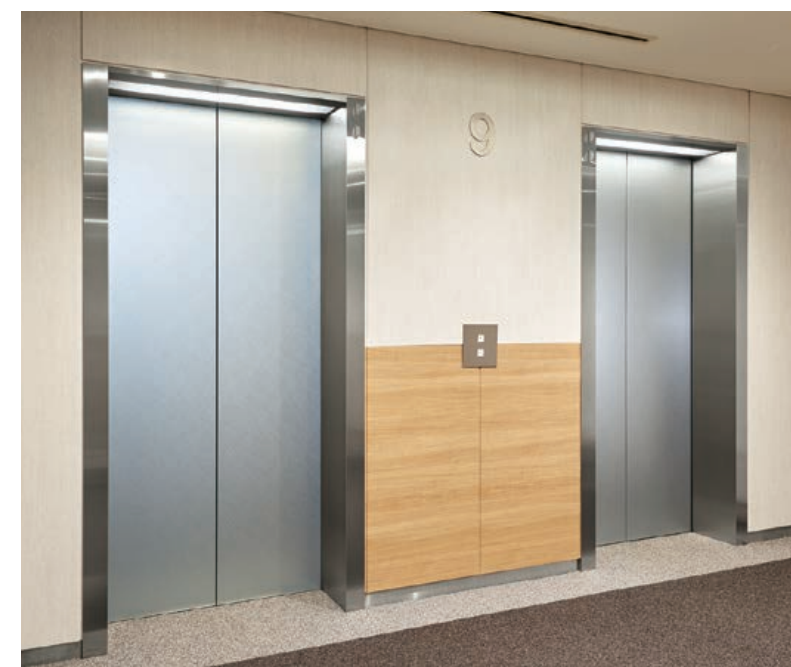
17-person passenger elevator, 9th floor elevator hall (after renewal)