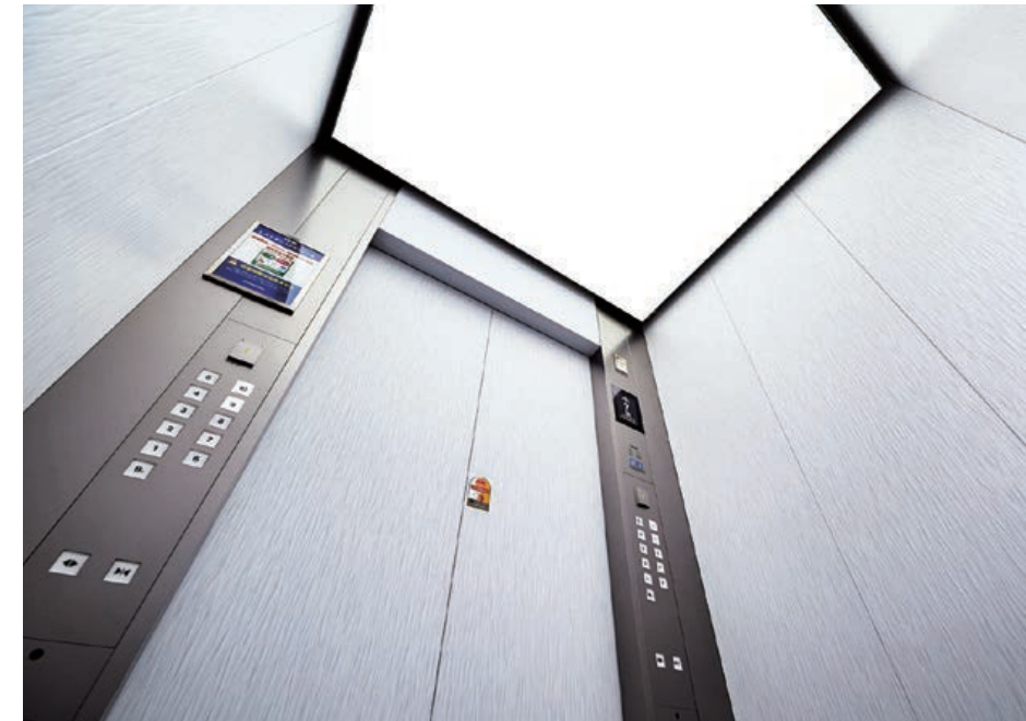
17-person passenger elevator car ceiling (after renewal)