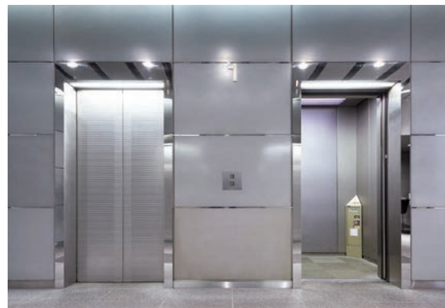
17-person passenger elevator, 1st floor elevator hall (before renewal)