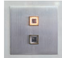
Landing buttons (before renewal)