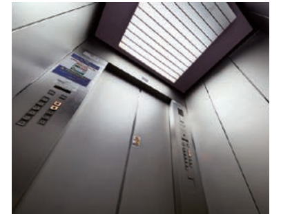
17-person passenger elevator car ceiling (before renewal)