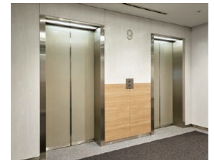
17-person passenger elevator, 9th floor elevator hall (before renewal)