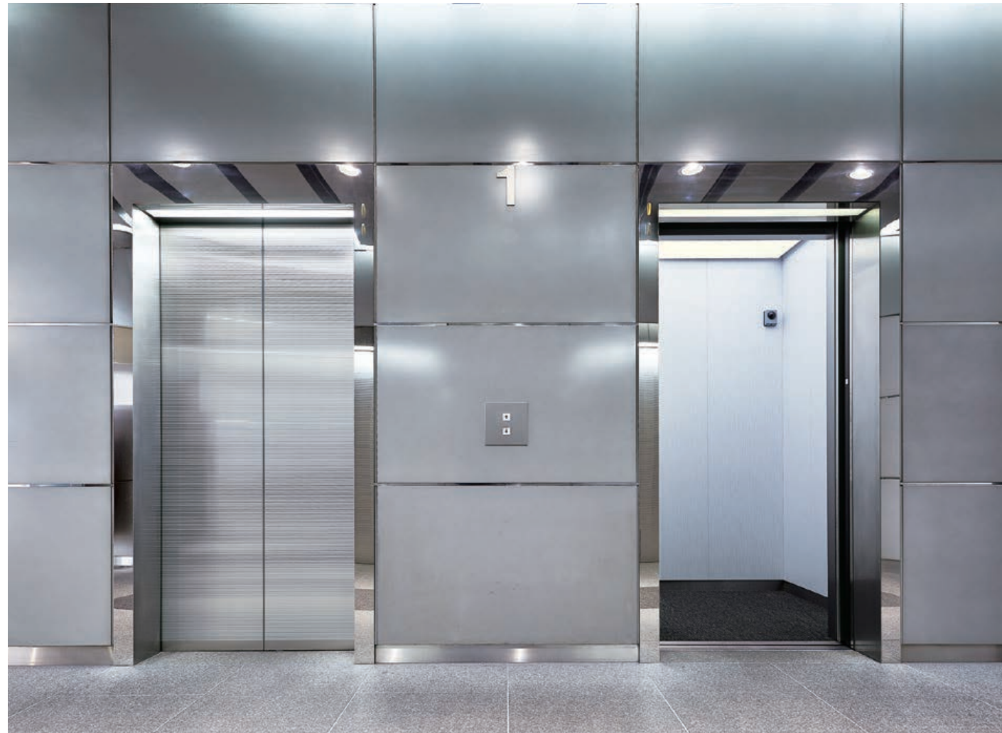
17-person passenger elevator, 1st floor elevator hall (after renewal)