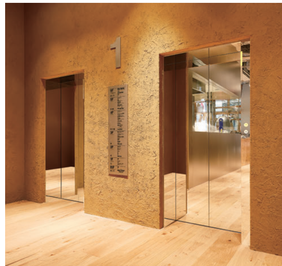
13-person passenger elevator, 1st floor elevator hall (MUJI GINZA)