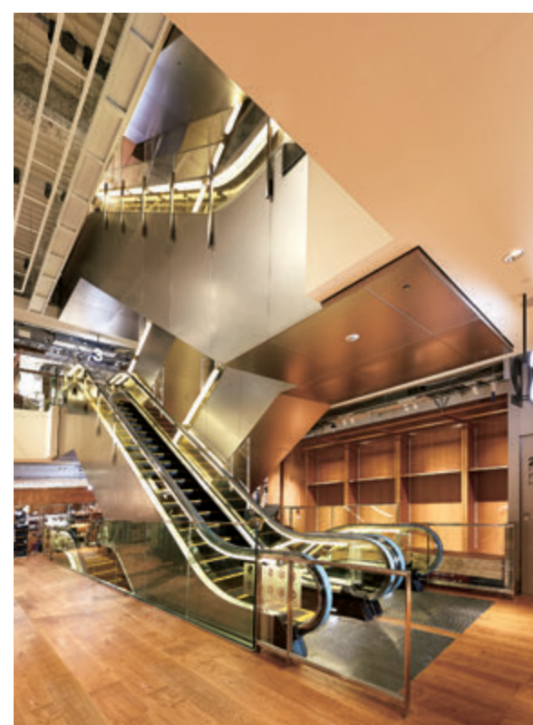
Escalator, 1st floor landing (MUJI GINZA)