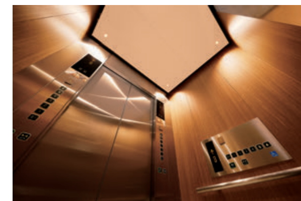
13-person passenger elevator car ceiling (MUJI GINZA)