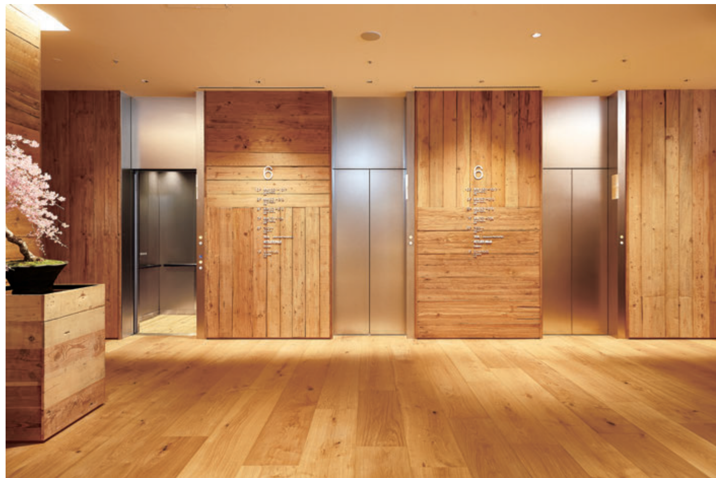
13-person passenger elevator, 6th floor elevator hall (MUJI HOTEL GINZA)