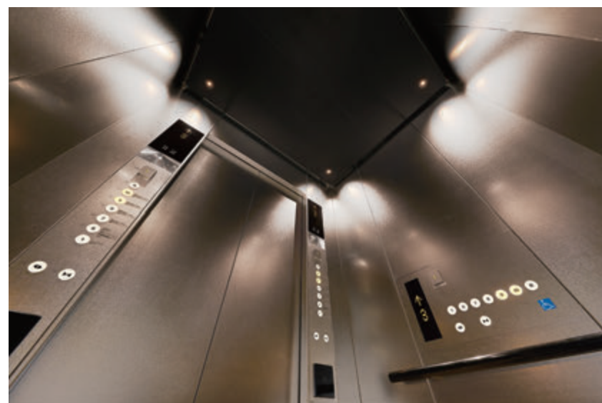
13-person passenger elevator car ceiling (MUJI HOTEL GINZA)