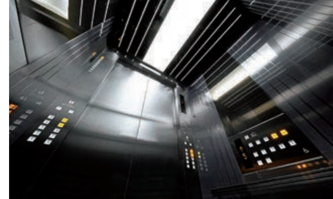
21-person passenger (emergency) machine room-less elevator car ceiling

21-person passenger (emergency) machine room-less elevator car