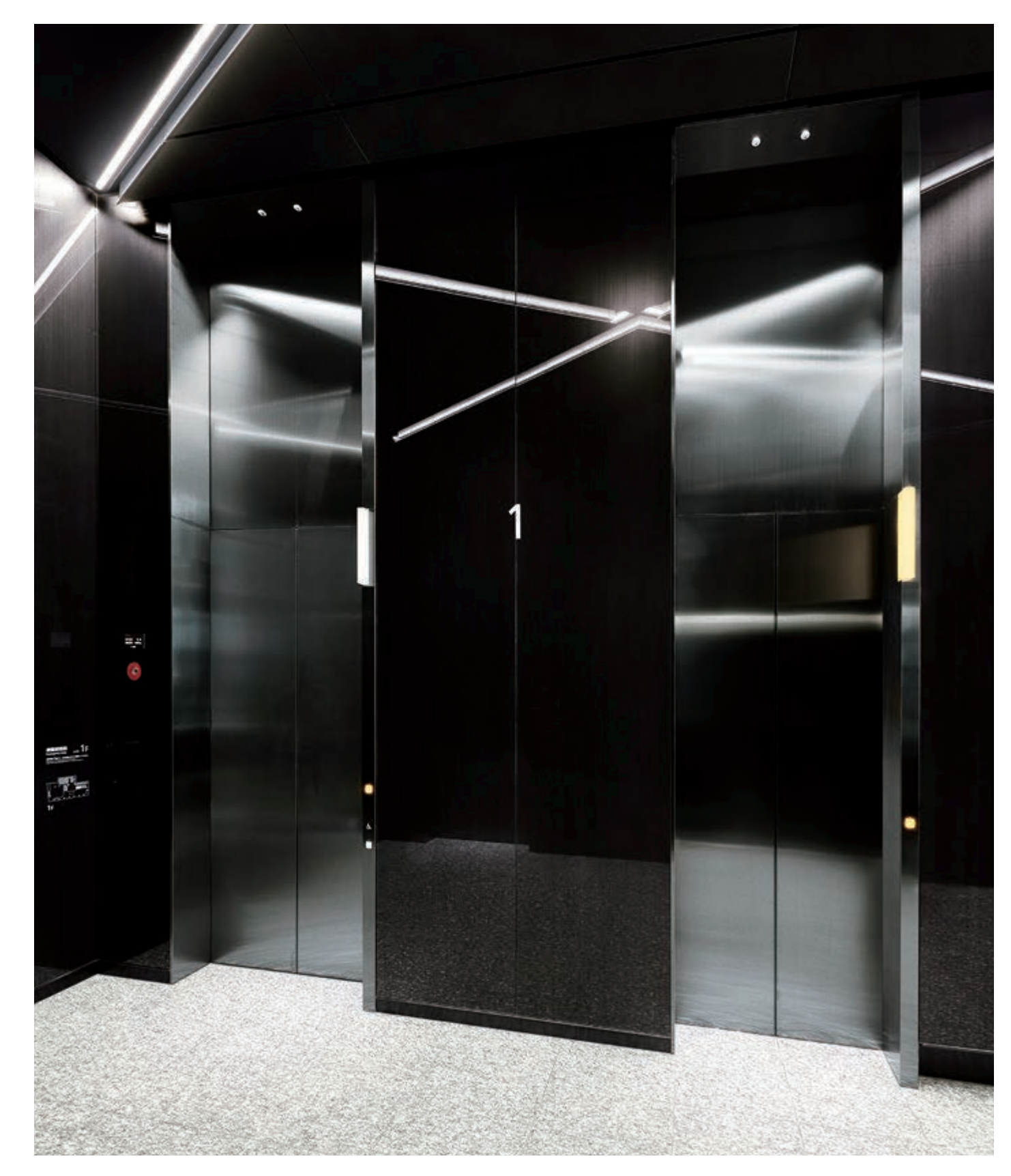
21-person passenger (emergency) machine room-less elevator and 20-person passenger elevator, 1st floor hall