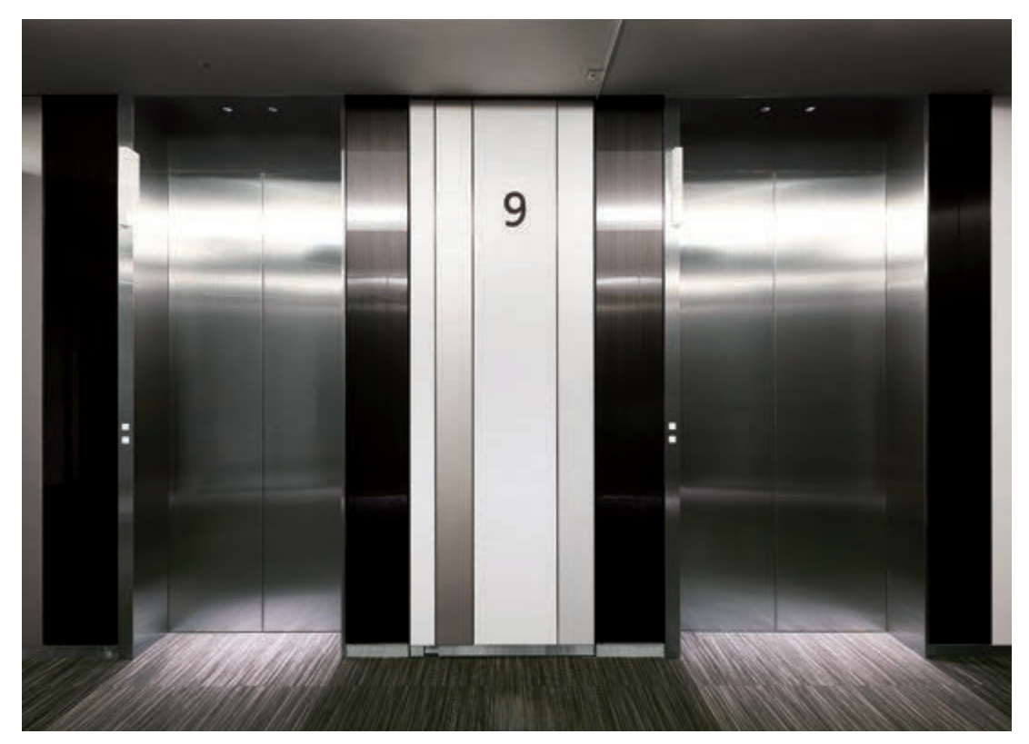
20-person passenger elevator, 9th floor hall