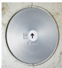
Landing buttons (after renewal)