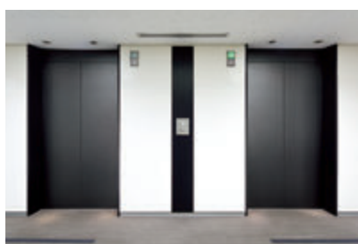
24-person passenger elevator, 7th floor hall