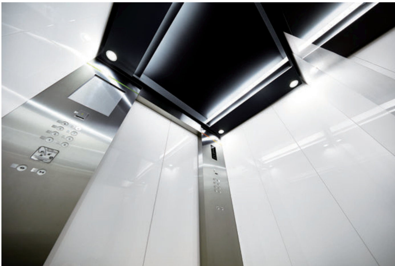
24-person passenger elevator car ceiling (after renewal)