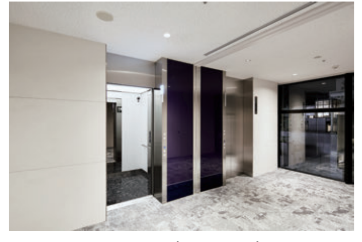
17-person passenger elevator and 15-person passenger elevator, 9th floor hall