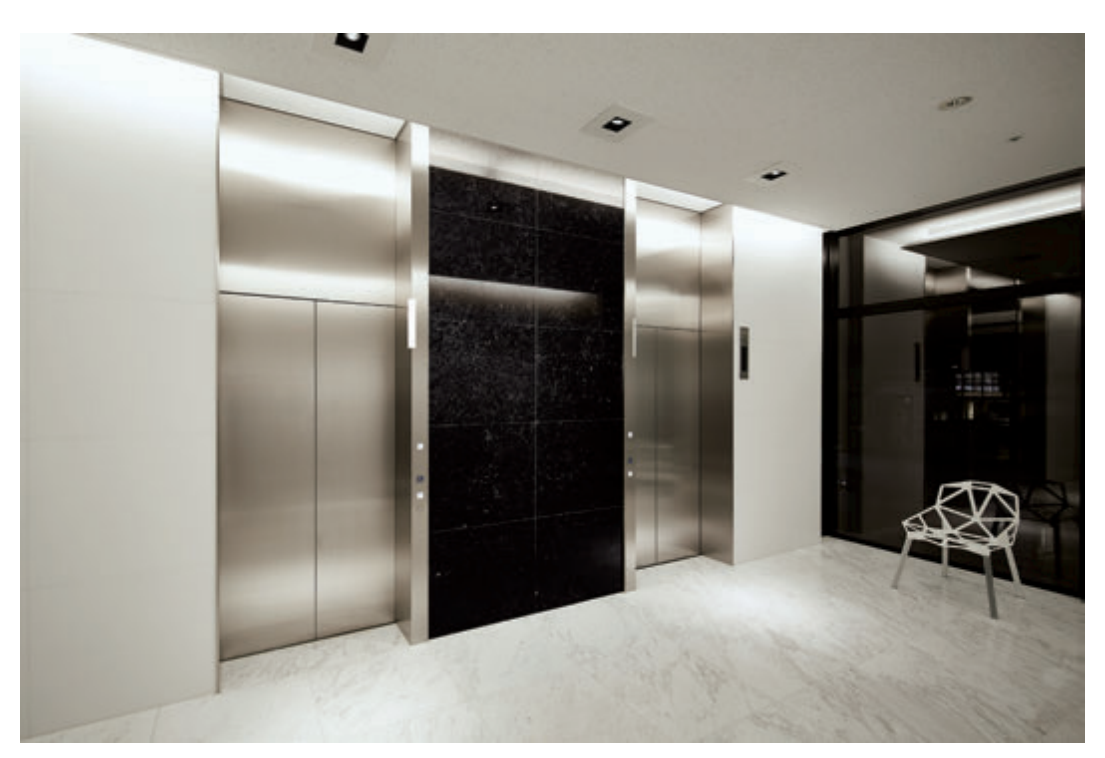
17-person passenger elevator and 15-person passenger elevator, 10th floor hall