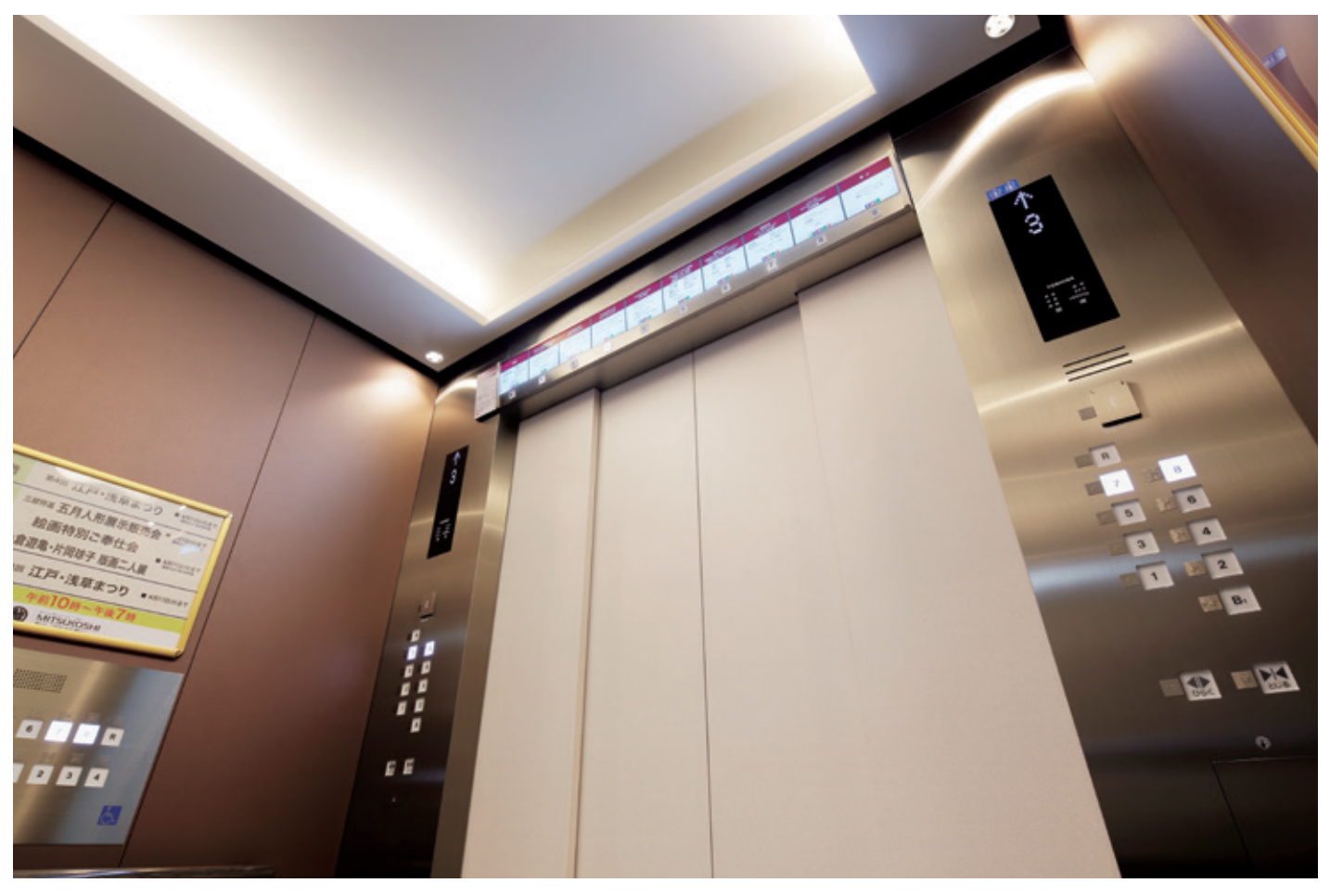
24-person passenger elevator car ceiling