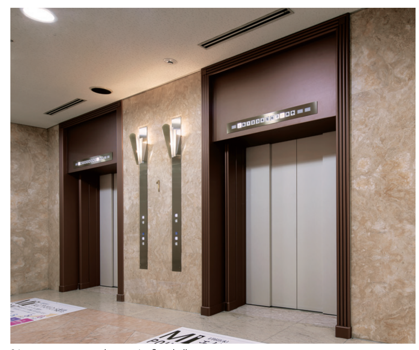
24-person passenger elevator, 1st floor hall