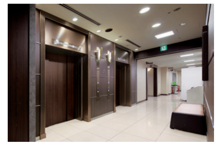
24-person passenger elevator, B1F hall