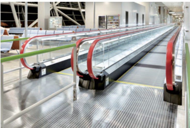
S1000 Moving Walk landing