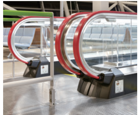
S1000 Moving Walk balustrade