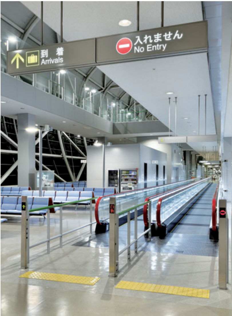
S1000 Moving Walk appearance