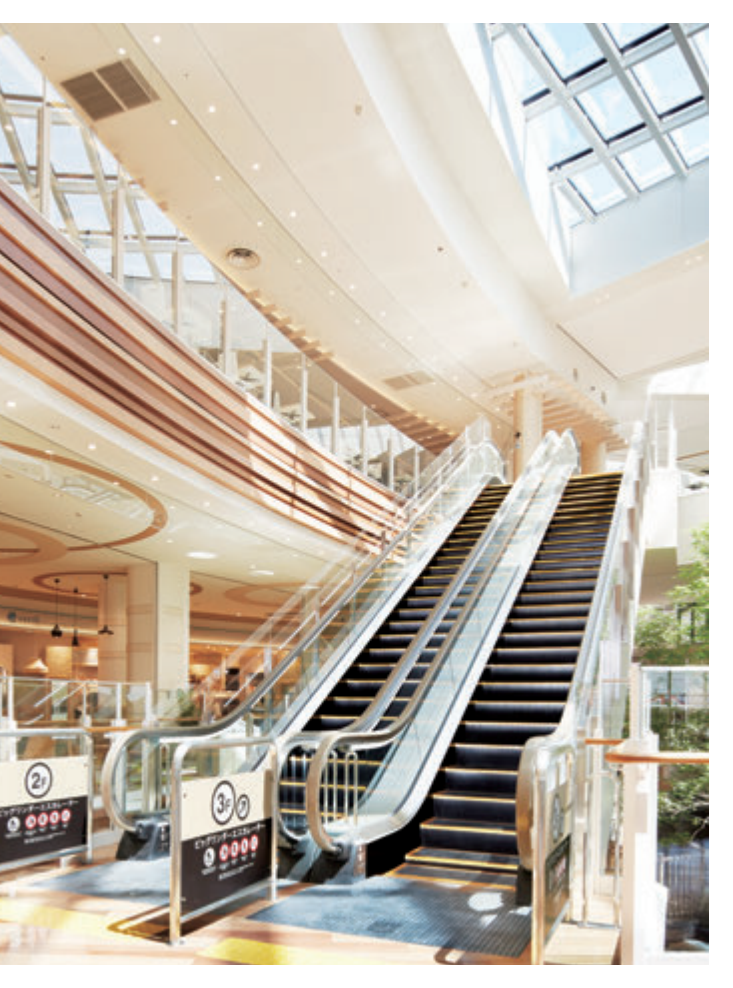
Escalator, 2nd floor (Big Wonder Escalator)

30-person passenger elevator car ceiling