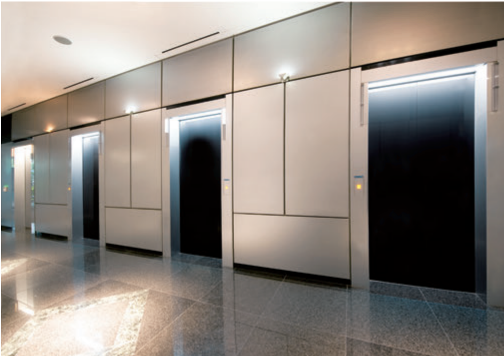
24-person passenger elevator, 1st floor hall (the elevator at far rear is pre-renewal)