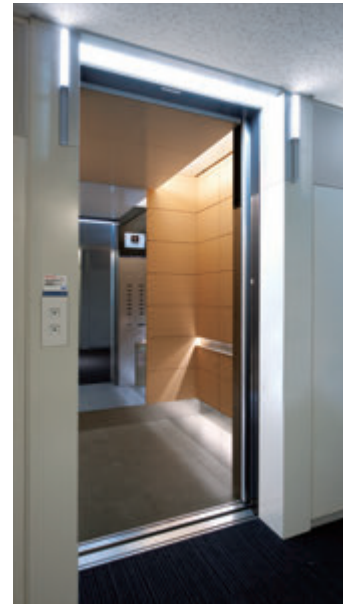
24-person passenger elevator car (after renewal)