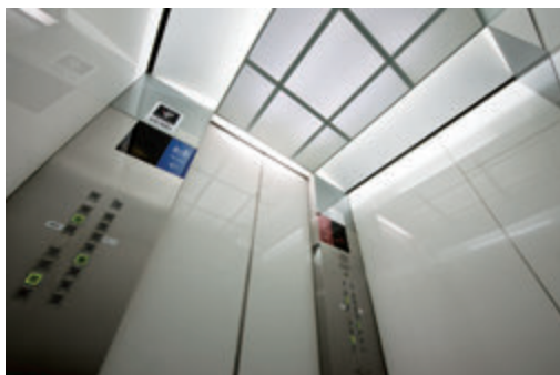
24-person passenger elevator car ceiling (before renewal)