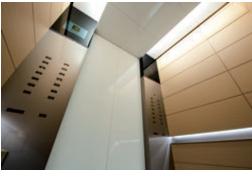
24-person passenger elevator car ceiling (after renewal)