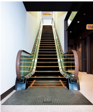
Escalator, 1st floor landing