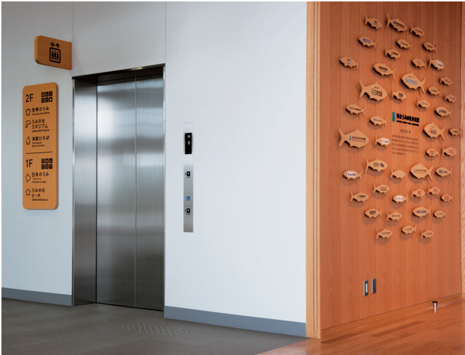
20-person passenger elevator, 1st floor landing (entrance hall left)