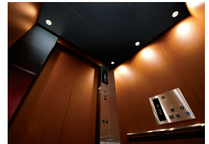
20-person passenger elevator car ceiling (entrance hall left)