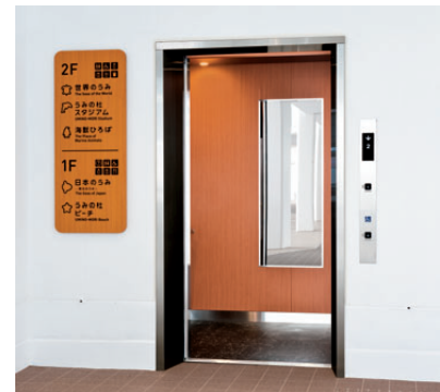
20-person passenger elevator, 2nd floor landing (Umino-Mori Stadium)