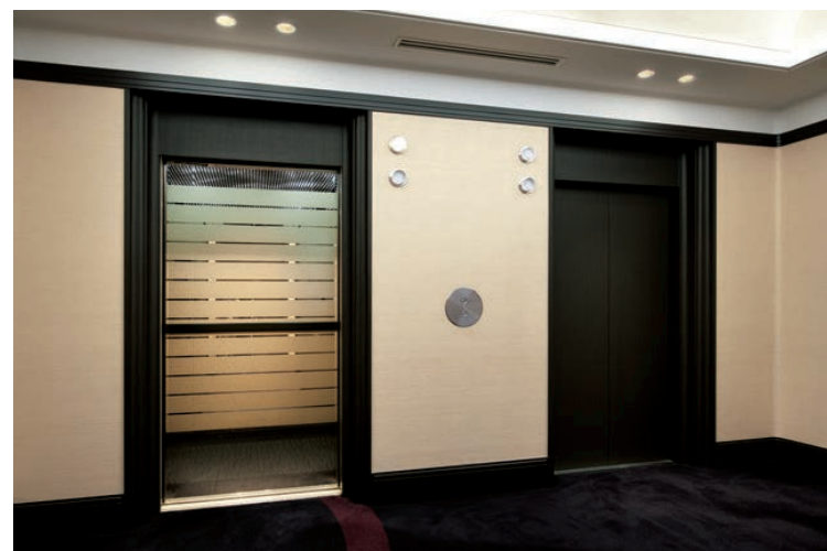
17-person passenger elevator, 3rd floor hall (the elevator at left is pre-renovation and the elevator at right is post-renewal)