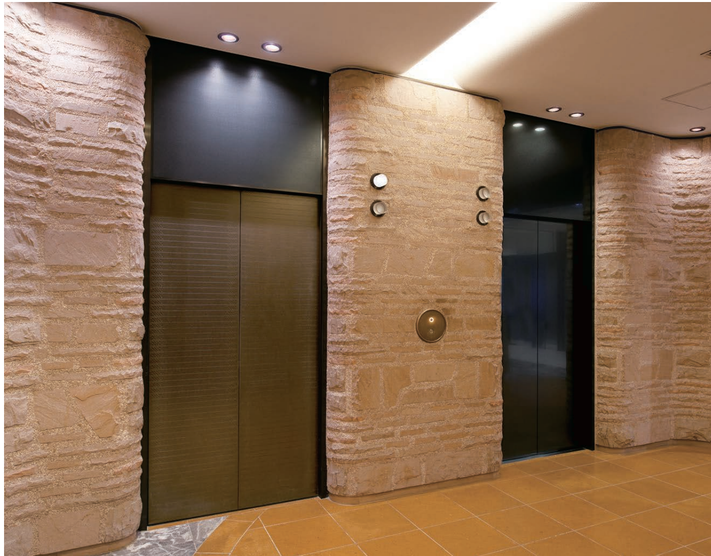
17-person passenger elevator, lobby floor hall (the elevator at left is pre-renovation and the elevator at right is post-renewal)