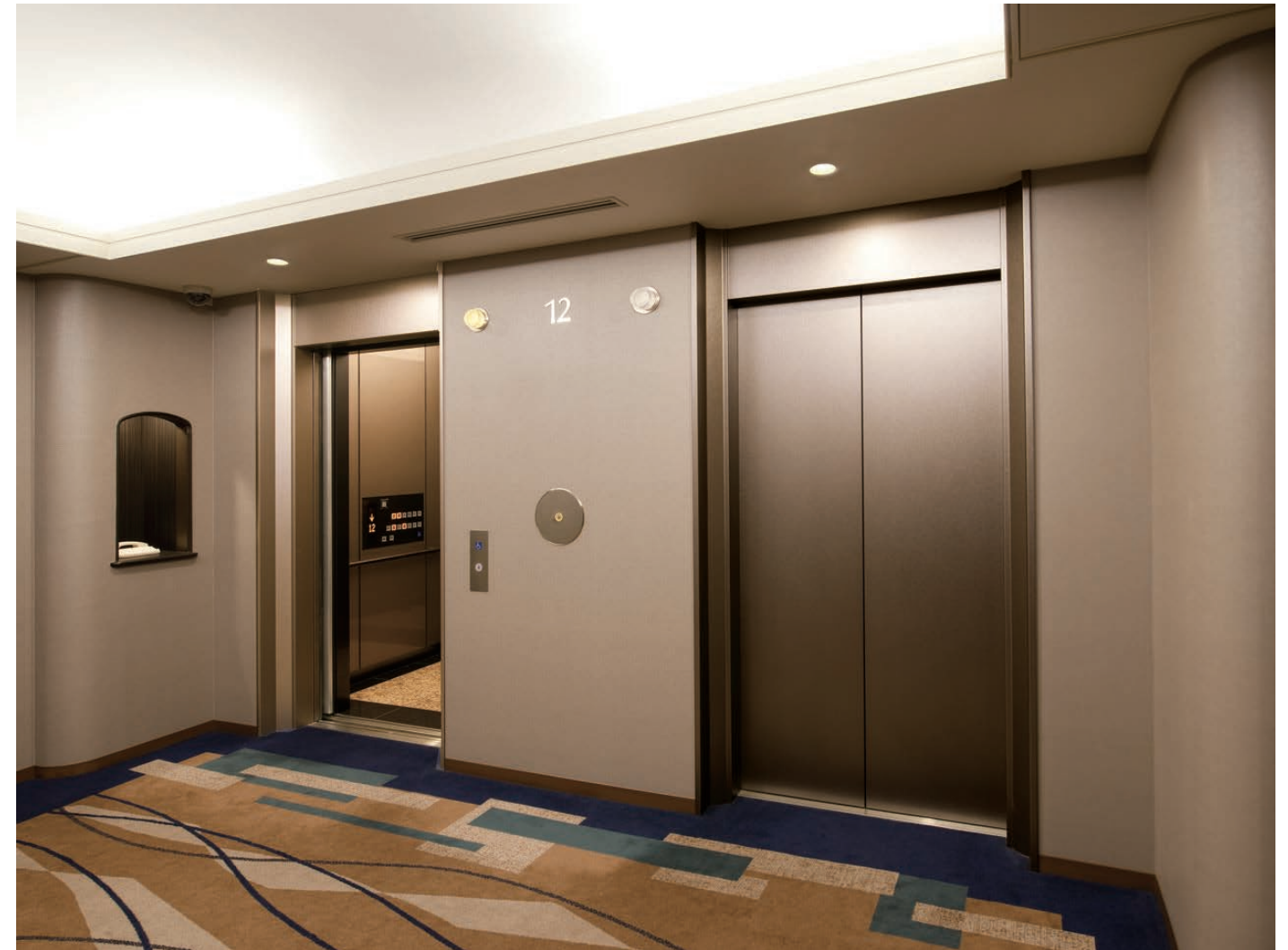
17-person passenger elevator, 12th floor hall (after renewal)