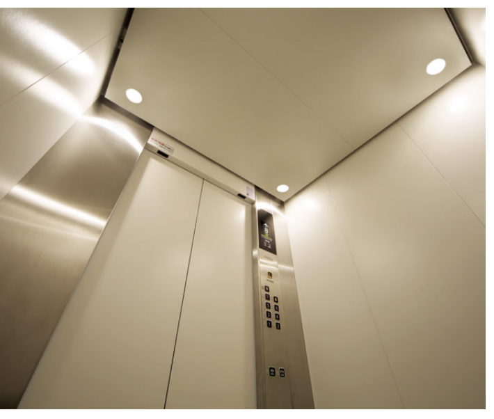
15-person passenger elevator car ceiling