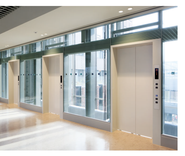
15-person passenger elevator, 3rd floor hall