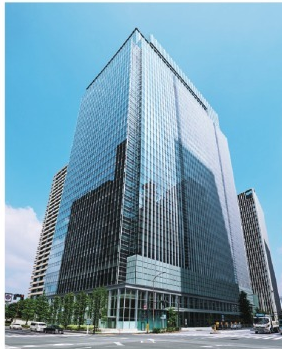
Building exterior (Otemachi One Tower)