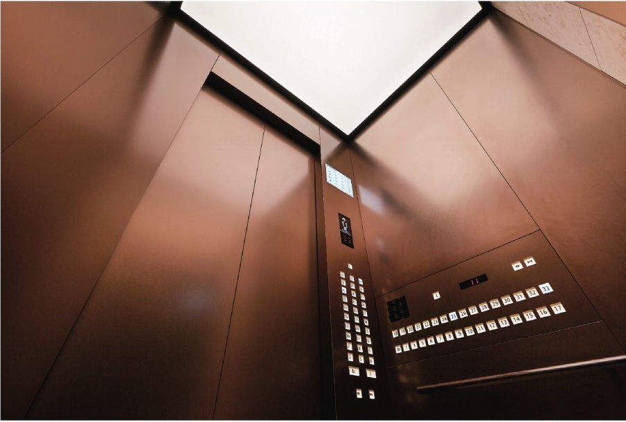
17-person passenger elevator car (Otemachi One Tower)