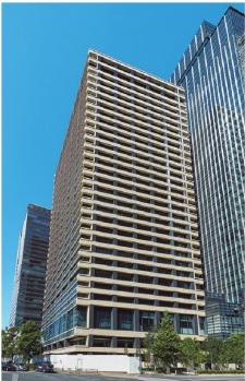
Building exterior (Mitsui Bussan Building)