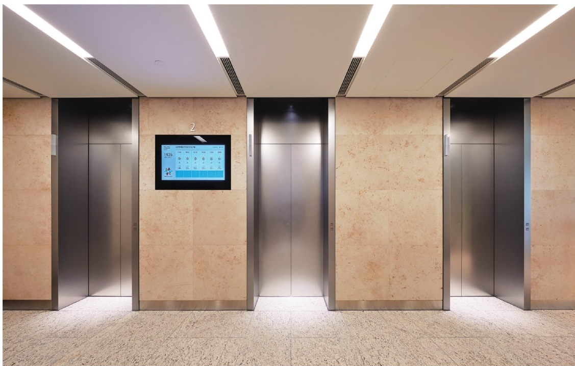
30-person passenger elevator, 2nd floor elevator hall (Mitsui Bussan Building)