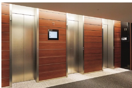
30-person passenger elevator, 11th floor elevator hall (Mitsui Bussan Building)